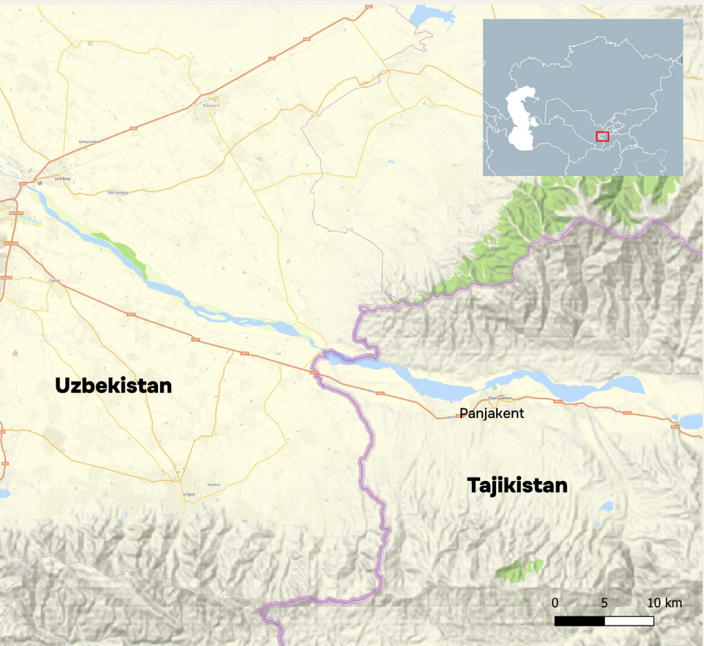
↑ Middle stream of Zarafshan river.