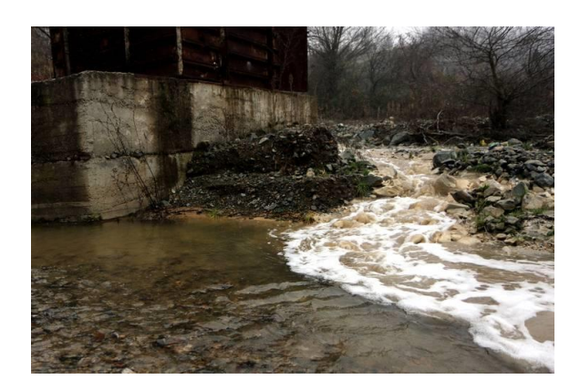
Photo 10. Pollution of Shnogh River with permanent effluent from Teghut tailing dump

Armenia —an ecological and human rights disaster, 2012)<sup>175</sup>.