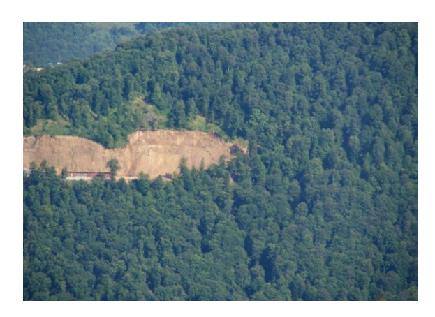
<sup>162</sup> DENMARK WITHDRAWS FUNDING FOR ARMENIAN MINING PROJECT

In 2018 February - Vallex Group declared suspension of all operations. Mine operator issued a statement declaring it will suspend all operations and lay off all workers except for few responsible for preservation of existing infrastructure<sup>163</sup>. The statement disseminated by "Vallex" Group says: "The opinions of the involved organizations prescribe that the further operation of Teghout ore dressing combine, without increase in the level of the stability of the tailing dump dam and ensuring seismic and static safety, will pose a real hazard of the self-collapse of the dam. Consequently, urgent measures shall be taken to ensure the stability of the tailing dump dam, as well as seismic and static safety"164. "Vallex" even planned to build a new tailing dump to operate the mine. However, Teghut CJSC, the second largest copper and molybdenum mine in Armenia, was transferred to Russia's VTB Bank due to its inability to repay the $ 380 million loan. After the mine is reopened the former owner of the company "Vallex" group warned about the risk of collapse of the tailings dam and possible victims. 165However, the work of the mine and the enrichment plant continued.