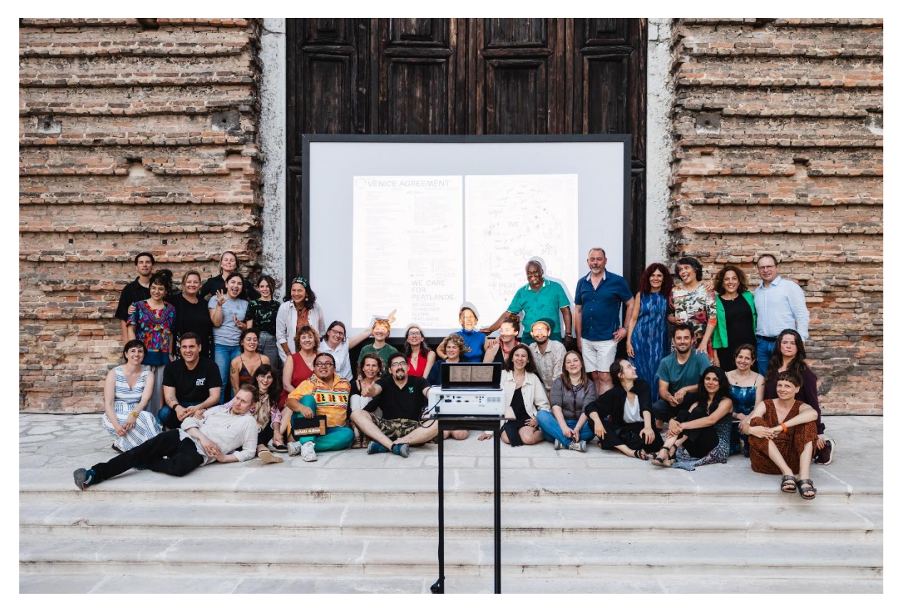
Fig. 1: Ceremonial signing of the "Venice Agreements" on 2nd June 2022, World Peatland Day in Venice. TBA21–Academy's Ocean Space.

On 2<sup>nd</sup> June 2022, World Peatland Day, the Venice Agreement was ceremoniously signed and presented to the public in Venice. It emphasises the importance of local initiatives and communities for global peatland protection. To develop the agreement, 40 peatland conservationists from all over the world met for two days in Venice. The idea emerged from the transdisciplinary work of Ensayos, an international-transdisciplinary art collective together with the Wildlife Conservation Society Chile (WCS) and the Michael Succow Foundation, partner in the Greifswald Mire Centre.