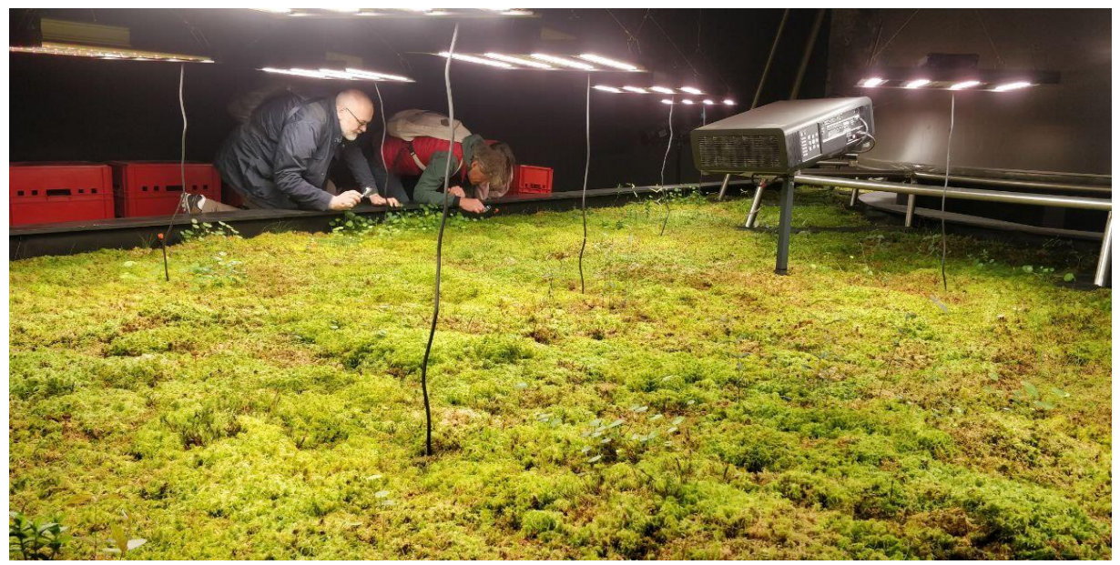
Fig.5: During the workshop, the group visited the Chilean pavilion "Turba Tol" at the Art Biennale. Here, an immersive installation with living peat mosses from paludiculture, sound and video installation and a bog scent provided a bog experience for the audience.

Fig.4: Expertise on peatlands comes in many shapes and sizes. The Venice Agreement is therefore based on transdisciplinary experiential knowledge between practical conservation work, natural sciences, indigenous science, youth activism, land management, law-making, education and arts.